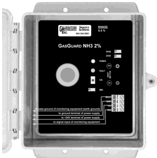
Figure 2: Wiring diagram