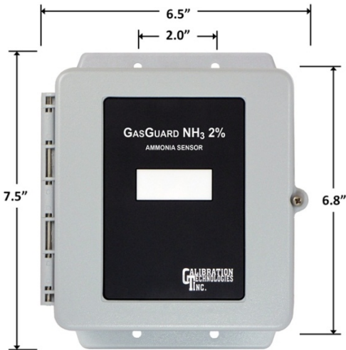
Figure 1: Mounting dimensions