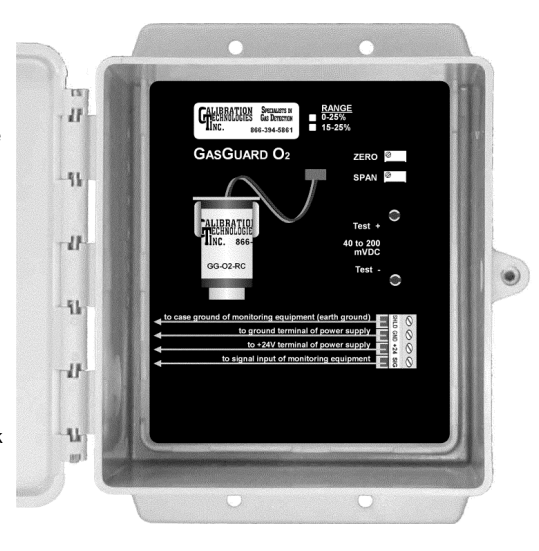
Figure 2: Wiring diagram