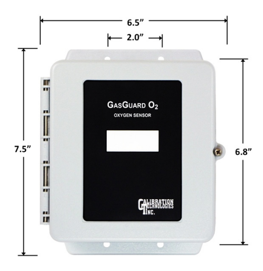
Figure 1: Enclosure dimensions