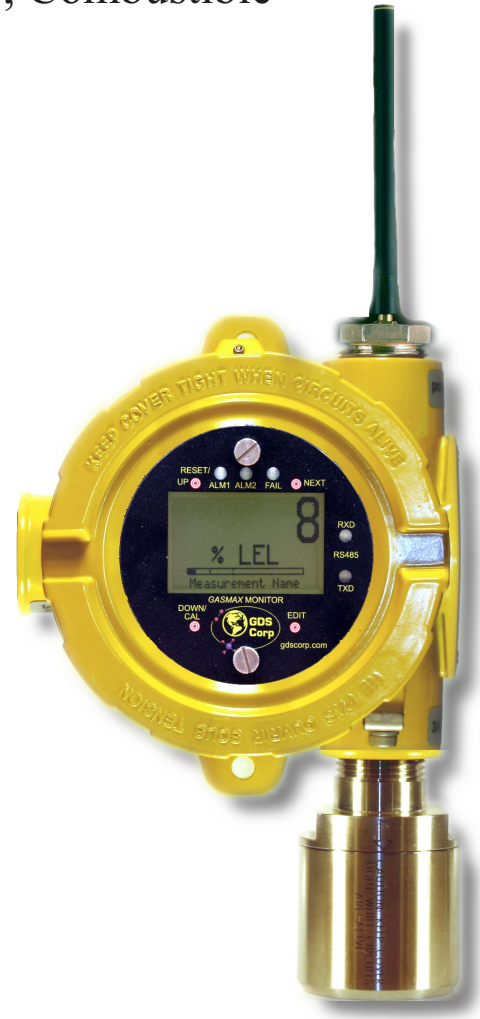
Shown with local stainless steel sensor head and 900Mhz whip antenna

An internal 900Mhz or 2.4Ghz license-free spread-spectrum wireless modem allows the GASMAX IIx to transmit gas detection data to a remote host controller. Every 6 seconds, the GASMAX IIx