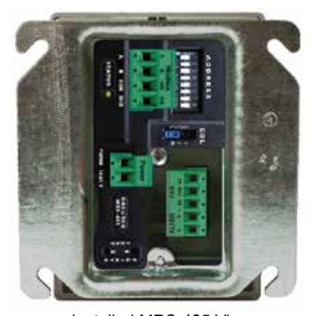
Installed MRS-485 View

the RS-485 bus. The power for the MRS-485 adapter is connected via a two terminal screw type connector, 12 to 24 VAC or 12 to 24 VDC and no polarity. Note: Running the Modbus cable adjacent to or in the same conduit with high voltage wires is not recommended as there may be interference from the high voltages.