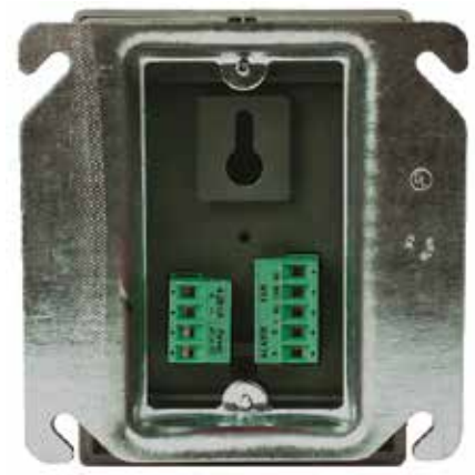
6-Series Rear View

The Macurco MRS-485 output is connected via a four terminal screw type connector. The MRS-485 adapter is wired in the standard 2W-Modbus circuits definition with selectable built-in terminating resistors at the ends of