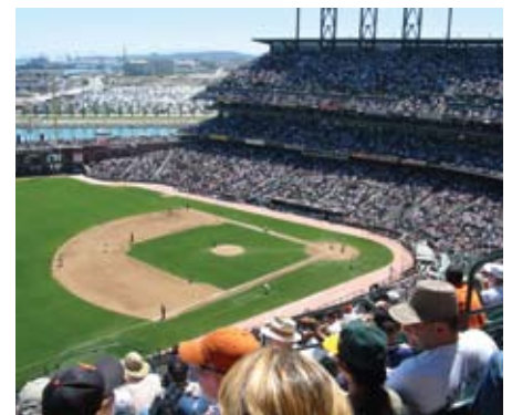
ProRAE Guardian is ideal for threat monitoring and detection of large-scale public venues