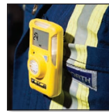
Easy To Wear