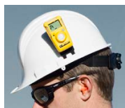
Hard Hat Clip