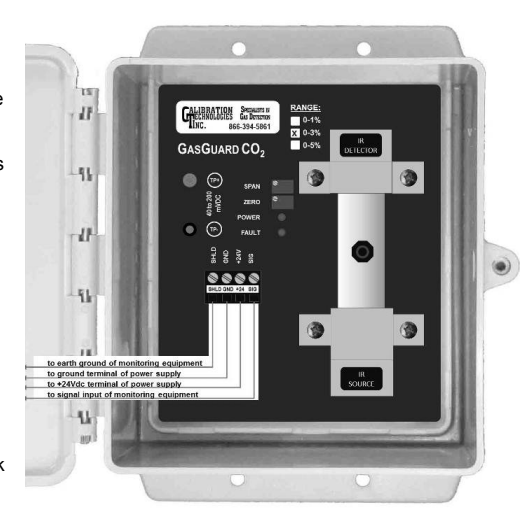
Figure 2: Wiring diagram