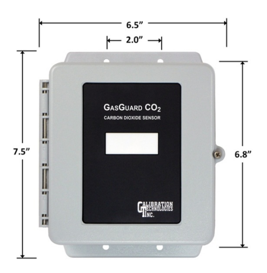
Figure 1: Mounting dimensions