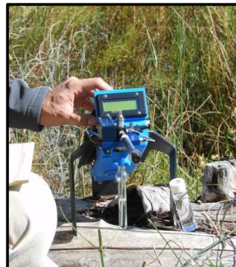
FROG-4000™ GC System.