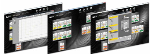
DEGA VISIO III visualization software