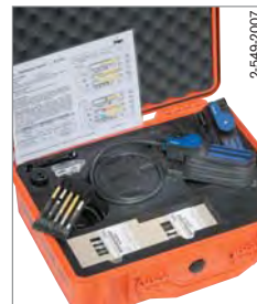
Civil Defense Simultest (CDS) Kit