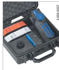
accuro® Hard Side Kit