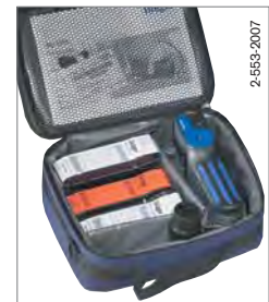
accuro® Soft Side Kit