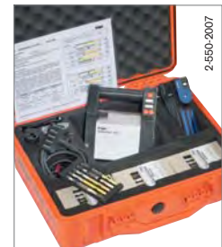
CDS/HazMat Kit with Quantimeter