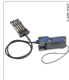
Simultaneous Test Set