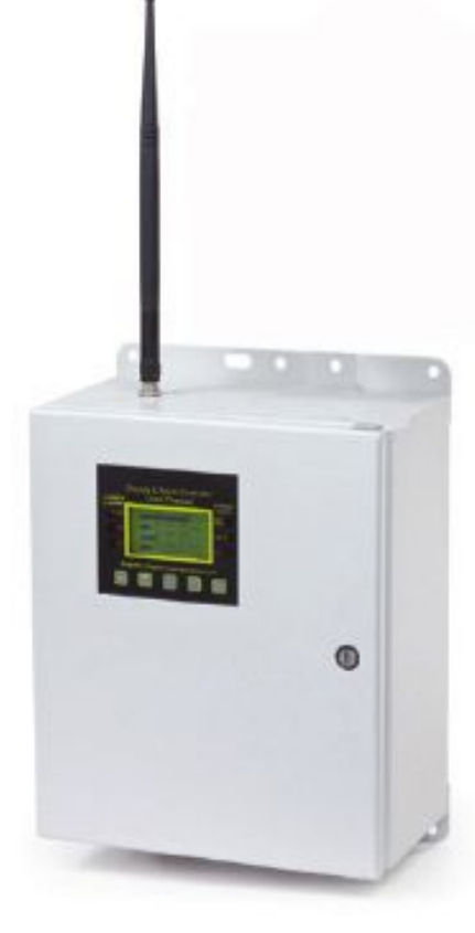
Available in NEMA 4X non-metallic, painted or stainless steel and NEMA 7 explosion proof wall mount