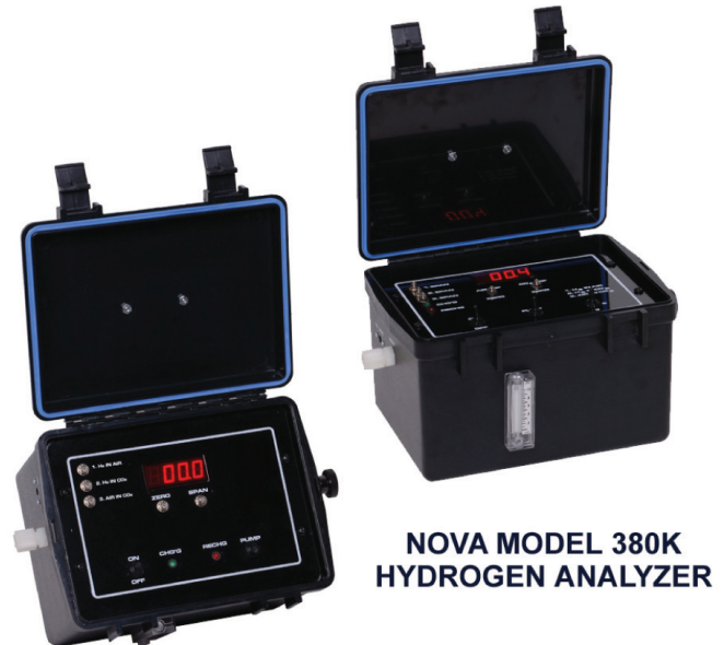
NOVA MODEL 380K HYDROGEN ANALYZER