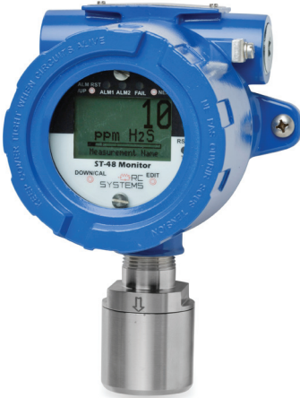
Aluminum "AL" XP model

"The Art of Gas Detection" - Built with our Proven ST-48 Transmitter