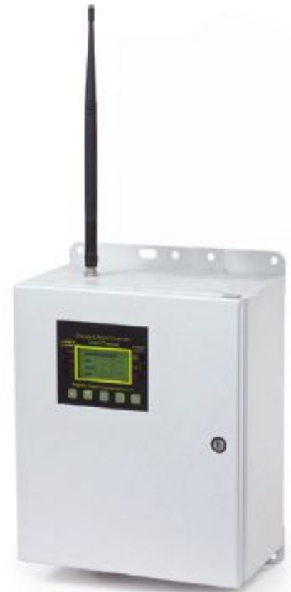
Available in NEMA 4X non-metallic, painted or stainless steel and NEMA 7 explosion proof wall mount

Unlike mesh networks and other systems designed for short range applications, the C2/TX utilizes Frequency-Hopping Spread Spectrum (FHSS) modems that offer higher power, longer range and lower susceptibility to interference. An optional multi-interface board supports an RS-232 or RS-485 wired serial port for remote MODBUS access, a solid-state data logger with USB interface, a second 900 MHz or 2.4 GHz radio for dedicated wireless remote access as well as an 802.11 WiFi interface for access via smartphones or tablets. WiFi-enabled C2/TX controllers also feature an integrated web server that allows users to remotely view real-time data, historical information and current confi password, remote users can change system setup variables. Finally, an optional satellite / cellular modem enables remote access from anywhere in North America.