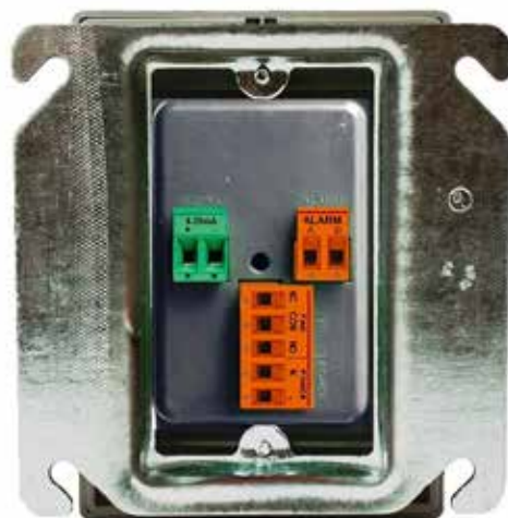
12-Series Rear View