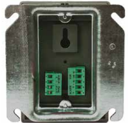
6-Series Rear View

The Macurco MRS-485 output is connected via a four terminal screw type connector. The MRS-485 adapter is wired in the standard 2W-Modbus circuits definition with selectable built-in terminating resistors at the ends of the RS-485 bus. The power for the MRS-485 adapter is connected via a two terminal screw type connector, 12 to 24 VAC or 12 to 24 VDC and no polarity. Note: Running the Modbus cable adjacent to or in the same conduit with high voltage wires is not recommended as there may be interference from the high voltages.