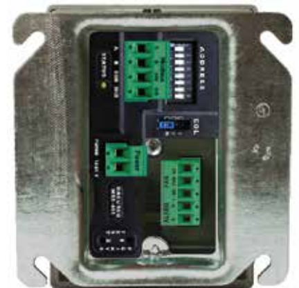
Installed MRS-485 View