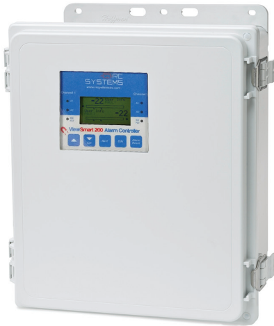
Nema 4X Non- Metallic Enclosure

"The Art of Gas Detection" - Built with our Proven ST-90 Dual Controller