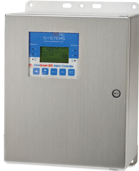
Stainless Steel Enclosure

The ViewSmart 200 2 Channel Controller provides simultaneous display and alarm functions for two monitored variables. Easy to configure and user friendly, the ViewSmart 200 can function as a critical alarm controller for toxic gases, combustible gases, vibration, tank levels and other process values.